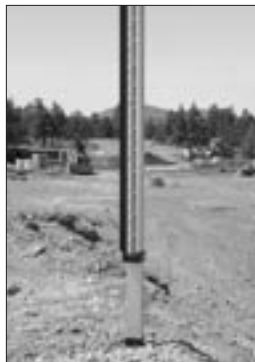
Rod extension fully collapsed

Allows you to extend the rod in one-foot increments up to four additional feet! 10-foot rods become 14-foot, and 15-foot rods become 19-foot.