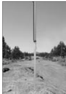
Rod extension fully extended to 4'